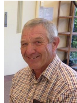
Everone's all smiles tonight.