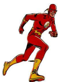
The Flash