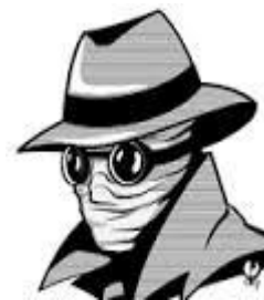
The Invisible Man Vivian Beaumont