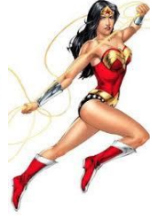
Wonder Women Dimitra Giannopoulos